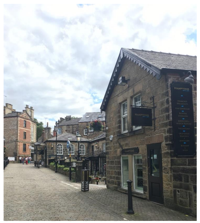
A nice day in Harrogate