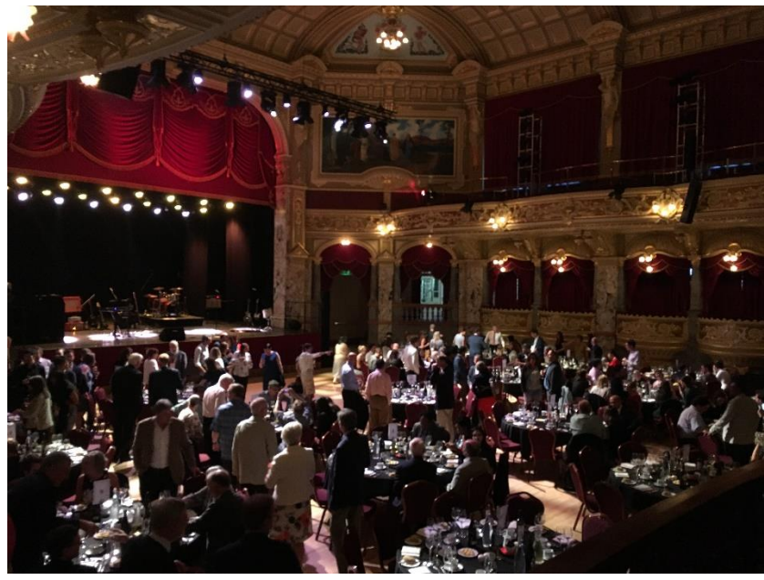
The conference dinner at the Royal Hall