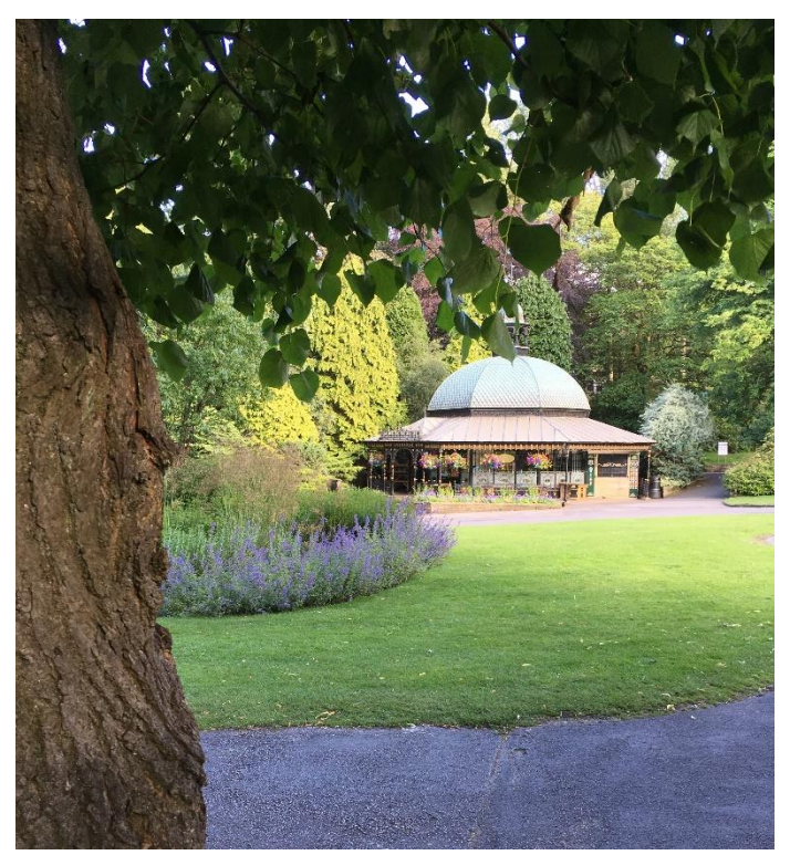
The park where the welcome reception was held